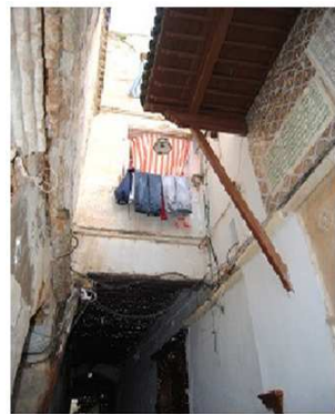
Vault ERRIH, West entry