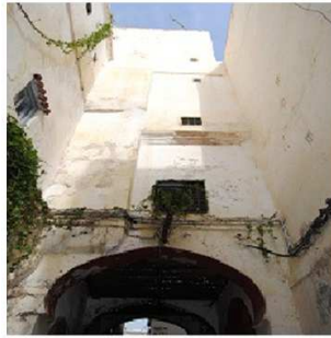
Vault ALAARS, West entry