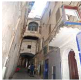
Vault Redjem Bey, West entry