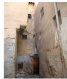
Vault Ben El Bouchaibi, East entry