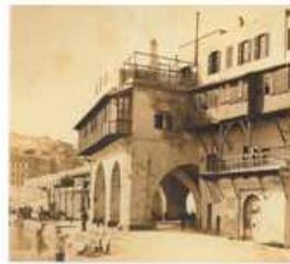
Vault El-Hout, year 1860