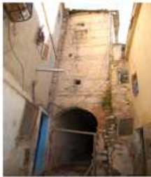
Vault CHEIKH EL ARAB, North entry