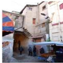
Vault SOUK EL ASR, North entry