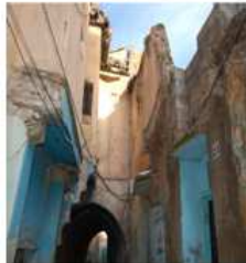
Vault EL KALIFA, East entry