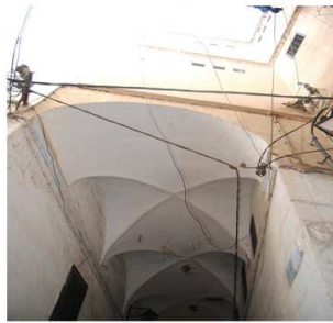
Vault DIWAN, West entry

gave the Ottomans the possibility of creativity by introducing new construction materials. The use of new calligraphic inscriptions on marble plates and installed on walls at the vault entrance which characterized the Ottoman era and there has not been in previously. This development does not stop with the design and building materials, but beyond the diversity of jobs, after it was used to connect neighborhoods and streets, and protect the leaders. They held the Diwan or throne room for the parish meeting to decide and consult and discuss various issues. It is also housed prayer rooms for the expansion of the mosque after he became cramped to accommodate a sufficient number of faithful and it also supports a school to teach the Koran and also a prayer room set.