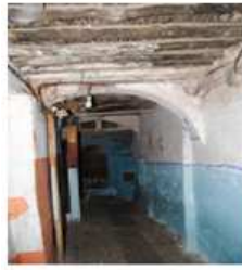
Vault EL KITAT, West entry