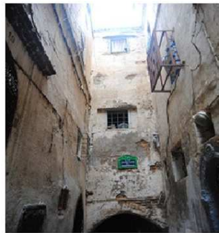
Vault EL KOUSAIR, East entry