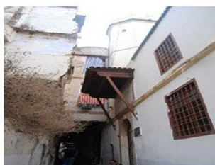
Vault BIALA, West entry