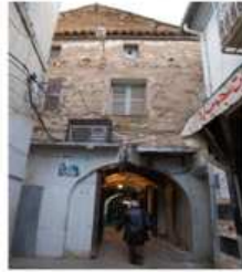
Vault EL KOURA, North